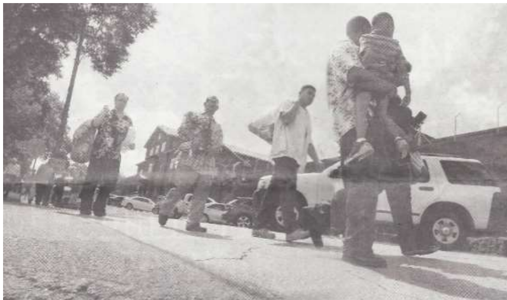
Inmates in donated clothing and carrying their belongings are freed in Huntsville. The free world can be bewildering for those who grew up behind bars.

Stiles Unit in Beaumont. "I squeezed out of it, and I ran."